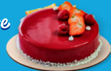
Red Velvet Glaze